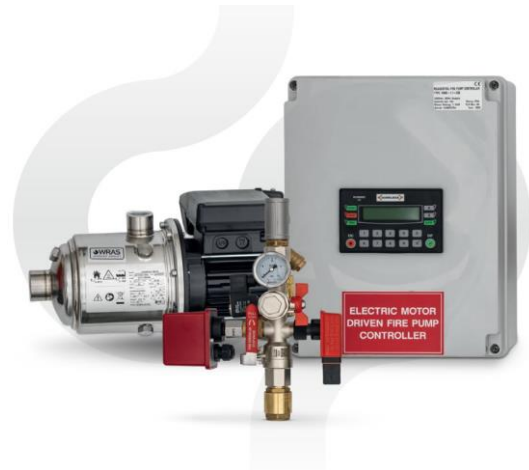
Picture is for illustration purposes and may not represent the exact specification offered

Dutypoint dedicated fire sprinkler pump kit comprising of 1no horizontal multistage pump, 1no domestic fire pump controller and 1no manifold assembly. The manifold assembly includes 1no LPCB approved dual pressure switch, 1no pressure gauge, 1no LPCB approved flow switch, 1no lockable valve, manual flow test valve with cap and an automatic weekly test outlet with strainer and 1/2" solenoid. BS9251:2021 (cat 1) compliant.