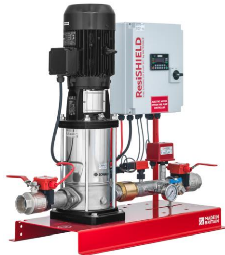
Picture is for illustration purposes and may not represent the exact specification offered

Dutypoint dedicated fire sprinkler pump set fitted with vertical multistage pump, residential fire pump controller with UL listed PLC, stainless steel manifold, LPCB approved dual pressure switch, pressure gauge, LPCB approved flow switch, lockable monitored discharge and suction valves, manual flow test outlet, automatic weekly test outlet with strainer and 1/2" solenoid, all pre-assembled and wired onto a single skid and compliant to BS9251:2021