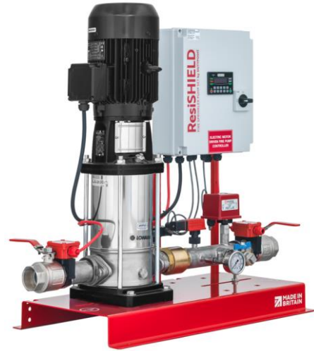
Picture is for illustration purposes and may not represent the exact specification offered

Dutypoint dedicated fire sprinkler pump set fitted with vertical multistage pump, residential fire pump controller with UL listed PLC, stainless steel manifold, 2no LPCB approved pressure switch's, pressure gauge, LPCB approved flow switch, lockable monitored discharge and suction valves, manual flow test outlet, automatic weekly test outlet with strainer and 1/2" solenoid, all pre-assembled and wired onto a single skid and compliant to BS9251:2021