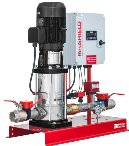
Picture is for illustration purposes and may not represent the exact specification offered

Dutypoint dedicated fire sprinkler pump set fitted with vertical multistage pump, residential fire pump controller with UL listed PLC, stainless steel manifold, 2no LPCB approved pressure switch's, pressure gauge, LPCB approved flow switch, lockable monitored discharge and suction valves, manual flow test outlet, automatic weekly test outlet with strainer and 1/2" solenoid, all pre-assembled and wired onto a single skid and compliant to BS9251:2021