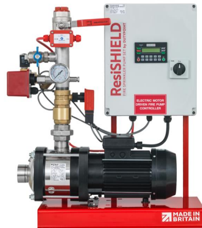
Picture is for illustration purposes and may not represent the exact specification offered

Dutypoint dedicated fire sprinkler pump set fitted with horizontal multistage pump, residential fire pump controller with UL listed PLC, stainless steel manifold, LPCB approved dual output pressure switch, pressure gauge, LPCB approved flow switch, lockable monitored discharge valve, manual flow test outlet, automatic weekly test outlet with strainer and 1/2" solenoid, all pre-assembled and wired onto a single skid and compliant to BS9251:2021