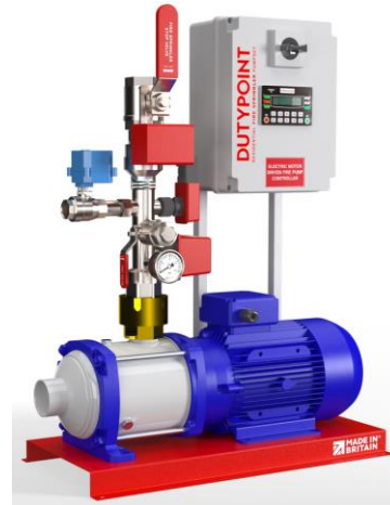
Picture is for illustration purposes and may not represent the exact specification offered

Dutypoint dedicated fire sprinkler pump set fitted with horizontal multistage pump, residential fire pump controller with UL listed PLC, stainless steel manifold, LPCB approved dual output pressure switch, pressure gauge, LPCB approved flow switch, lockable monitored discharge valve, manual flow test outlet, automatic weekly test outlet with strainer and 1/2" solenoid, all pre-assembled and wired onto a single skid and compliant to BS9251:2021